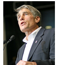
Mark Udall (D)