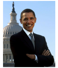
Barack Obama (D)