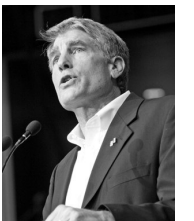
Mark Udall (D)