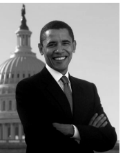
Barack Obama (D)