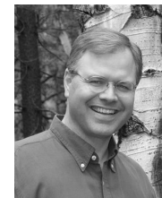
Bob Schaffer (R)